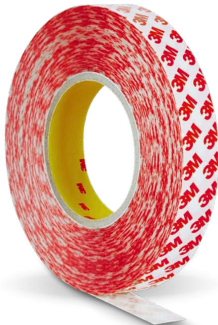
3M™ Double Coated Tape GPT-020